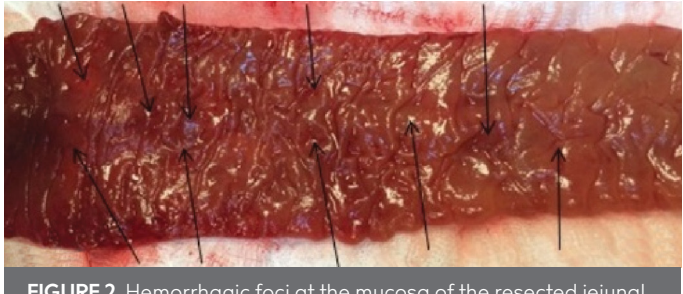
\ensuremath{\textbf{FIGURE 2.}} Hemorrhagic foci at the mucosa of the resected jejunal segment

problems or complications were observed. Follow-ups over 3 months after the surgery were uneventful. The postoperative pathological examination of the resected material indicated angiodysplasia (Figure 3). Informed consent was obtained from patient who participated in this case.