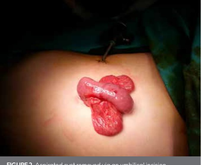
FIGURE 2. Aspirated cyst removed via an umbilical incision